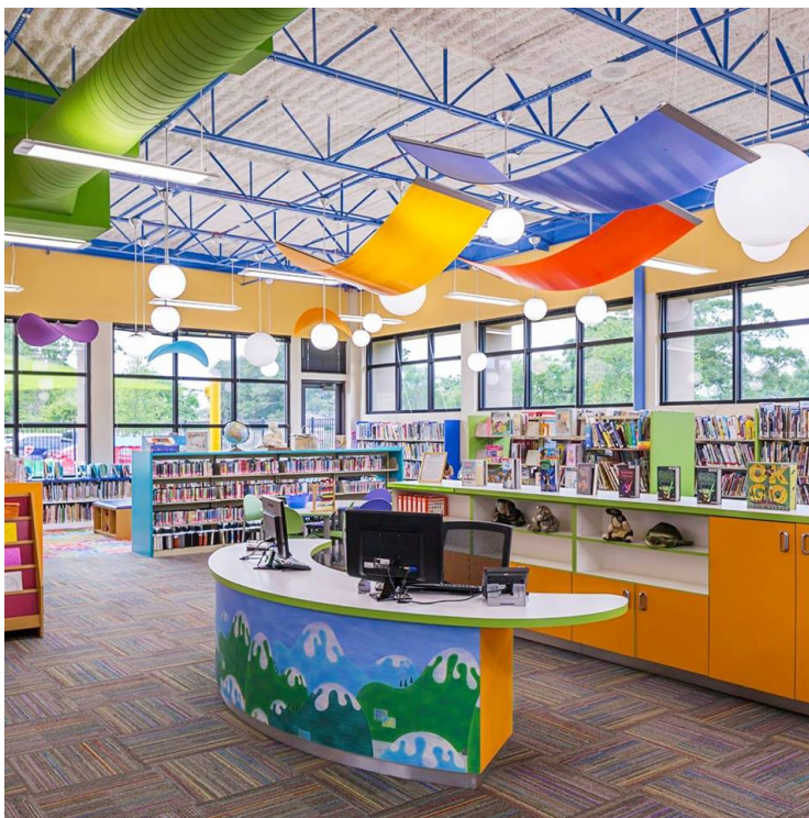
The library has also added Makerspace technology including a 3-D printer and green screen technology.