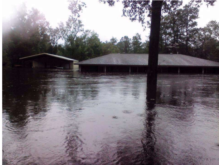
Home in Vidor