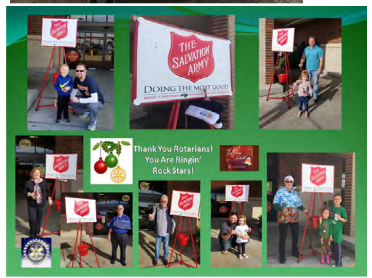
The RC of Conroe did it's annual day of bell ringing for the Salvation Army in early December. Again, lots of our kids and even some spouses came out to help with our day of service.