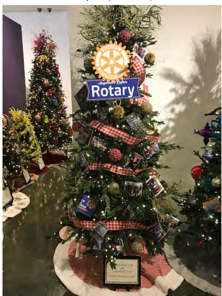
Angelina & Lufkin Rotary Clubs bought and decorated a Christmas tree for a community wide fundraiser for the Museum of East Texas.