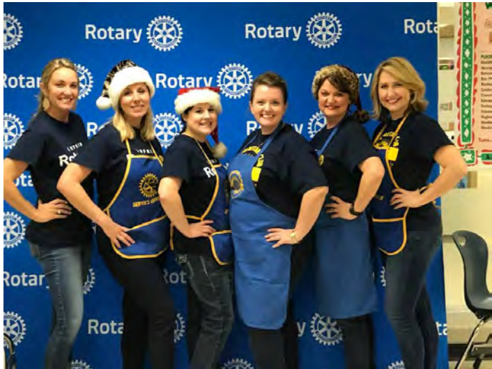
It is such a fun project and gives our members an opportunity to let our community know what Rotary does both locally and internationally.