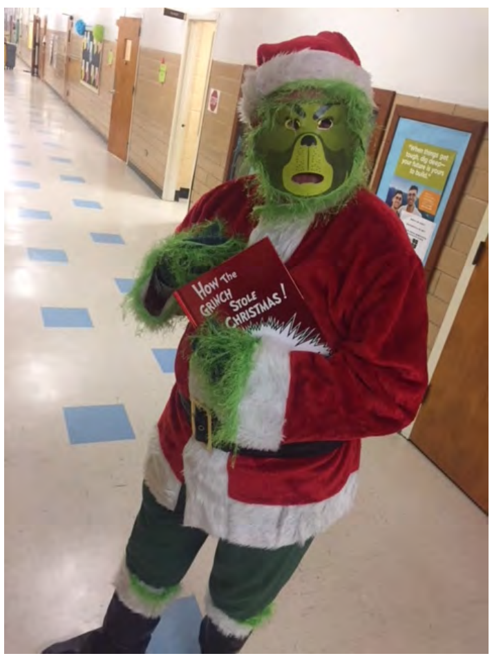
The Nacogdoches Rotary Reader program at Fredonia Elementary was special, as one Rotarian dressed up as the Grinch.