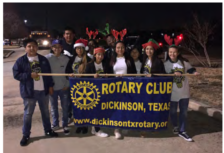
Dickinson High School Interact students carried the Rotary banner at the beginning of the parade.

The parade was led by Santa, city firetrucks and with Interact students carrying the Rotary banner. Many residents lined the street to catch the candy and toys being thrown by the parade participants. The Cajun Navy came from Louisiana to participate in the parade, and they were recognized by Dickinson Rotary with a special plaque to show appreciation for their help with Harvey relief efforts. At the conclusion of the parade, Santa was available at the Dickinson Library for pictures. It was a great parade enjoyed by all!