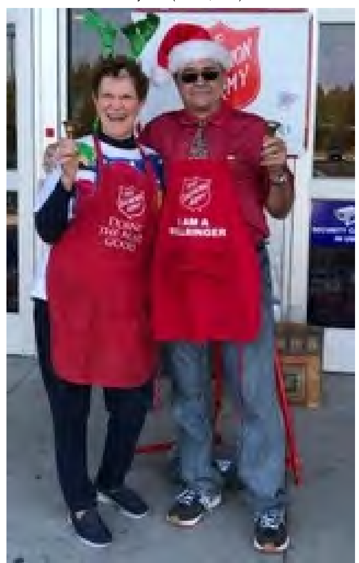
Dickinson Rotary supported the Salvation Army by ringing the Salvation Army bells at the Dickinson Kroger on Dec. 3<sup>rd</sup>. Many donations were received from shoppers throughout the day.