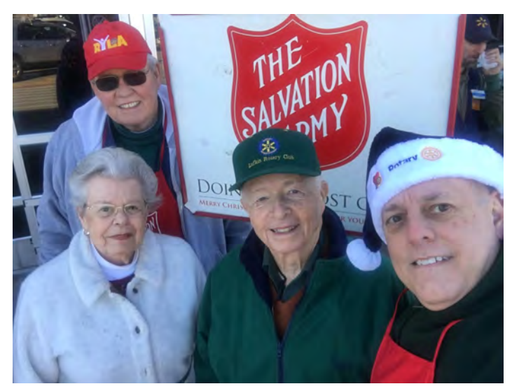
The Waffle Bake was followed up the next Saturday with service to the Salvation Army and the Red Kettle campaign. It is always so heartwarming to see children anxiously and joyfully place change in the kettle. Our Rotary Club is blessed to be a part of this important fund raising event.