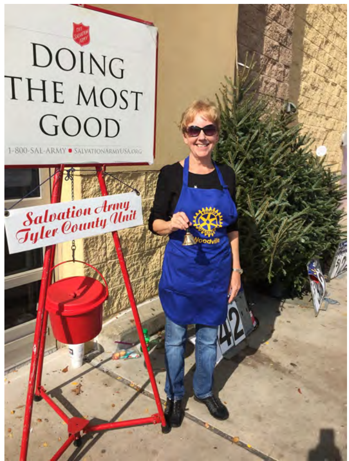
Rotarians rotated on 2 hour shifts greeting with a cheerful Merry Christmas and a smile.