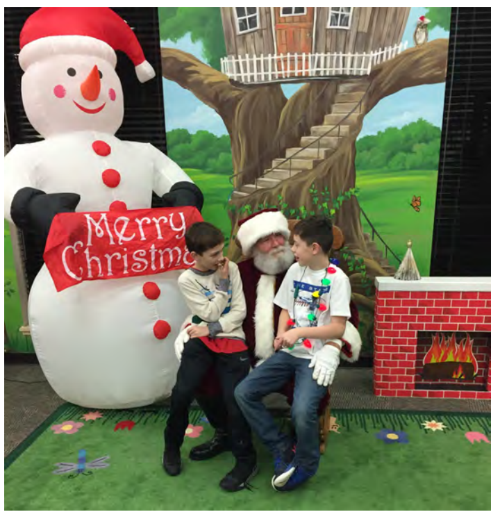
Children visited with Santa and had their pictures taken.