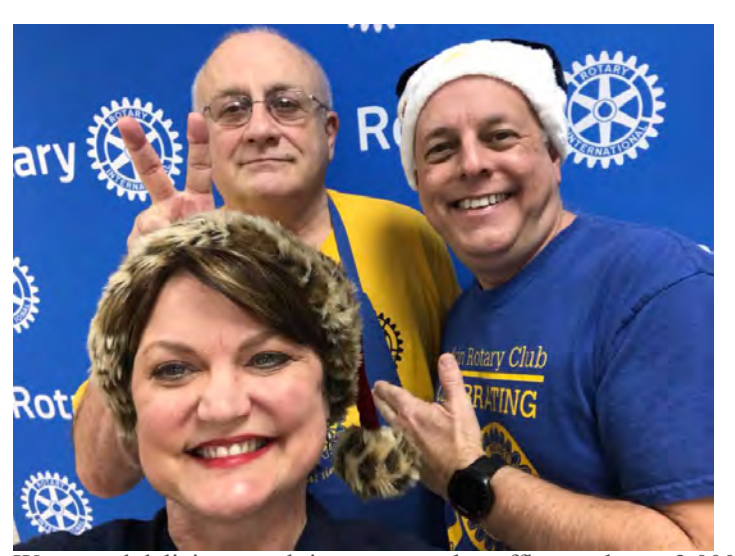
We served delicious, melt in your mouth waffles to almost 2,000 people during the three-night event in late November.