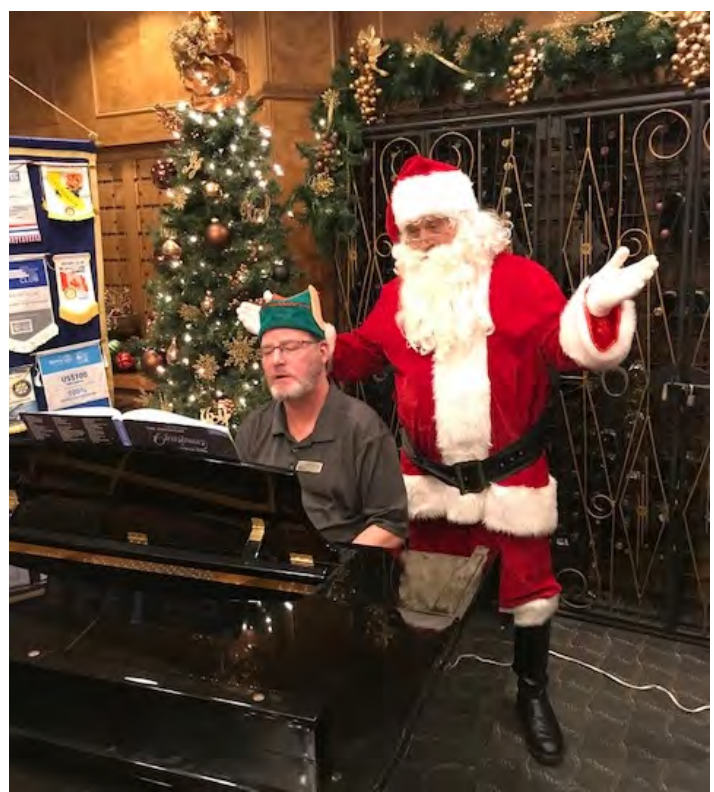
Santa Claus and his elf singing Christmas music at the Rotary Club Christmas Party.