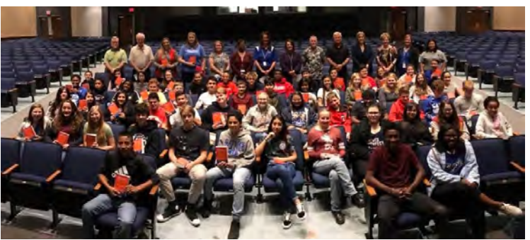
McAdams Junior High students, administrators and Rotarians

dictionary project, The Four-Way Test and how The Four-Way Test has withstood the test of time.