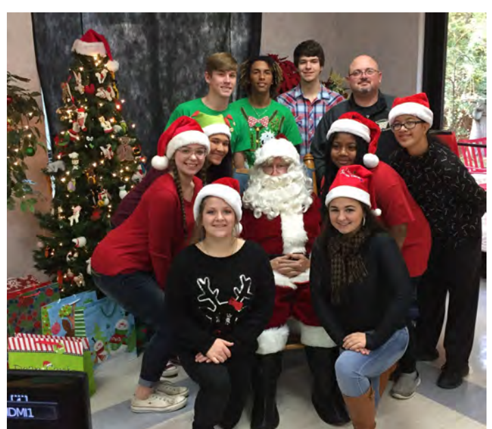
Rotary Club of Woodville's special community service project for the 15th year was Ring The Salvation Army Bell for the Tyler County Unit.

We collected over $5,200.00 this year for Salvation Army which will remain in Tyler County to help Tyler County residents.