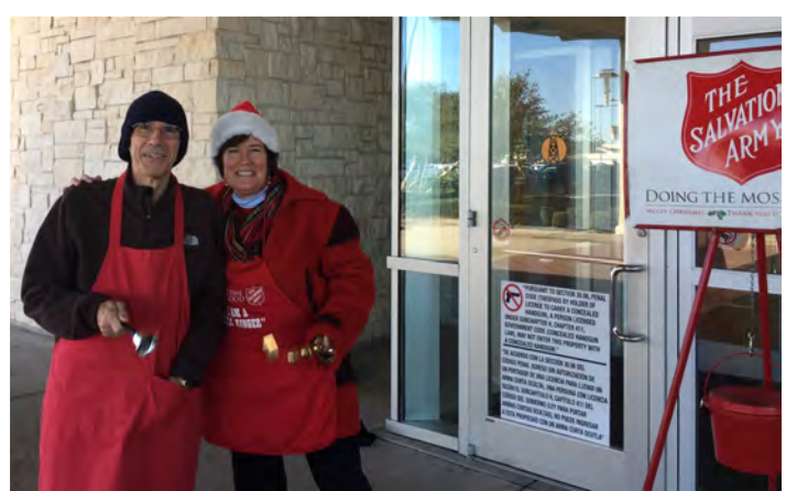
Beaumont Rotarians always enjoy participating in the Salvation Army Red Kettle drive by ringing the bell at the mall and this year was no exception. Club members were joined by friends and family members.