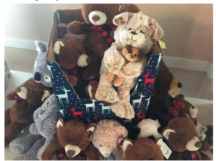
Our #TeddyBearDrive was even bigger and better this year! Rotary Club of Lake Conroe helps support this event with donating lots of teddy bears.