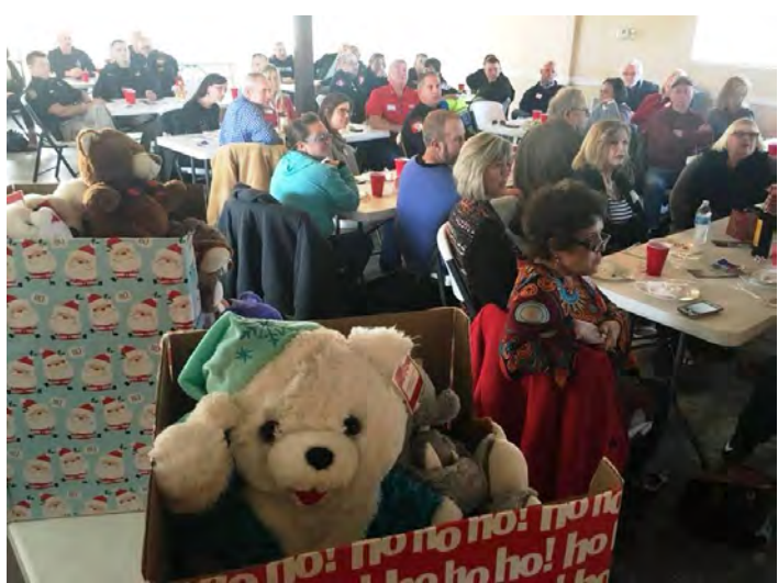
The monthly EATS Luncheon was over the moon today! We were so proud and honored to say thank you to all our first responders around the Montgomery Area!