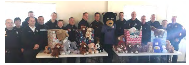
Rotary Lake Conroe Club helping to support our First Responders at the Teddy Bear Drive organized by the Montgomery Area Chamber. We are so grateful for all they do to keep us safe!