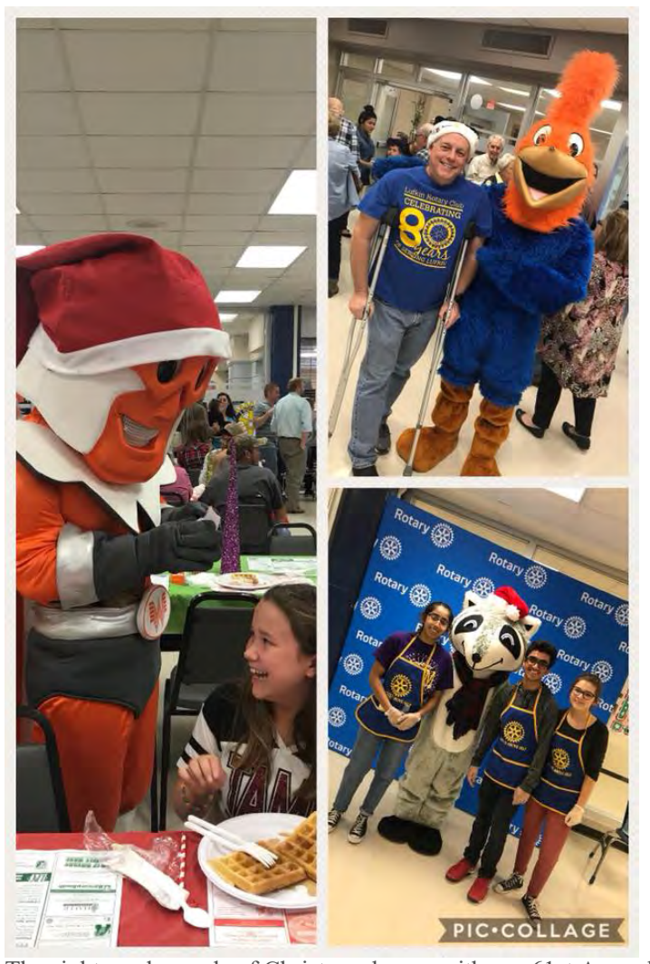
The sights and sounds of Christmas began with our 61st Annual Lufkin Rotary Club Waffle Bake.