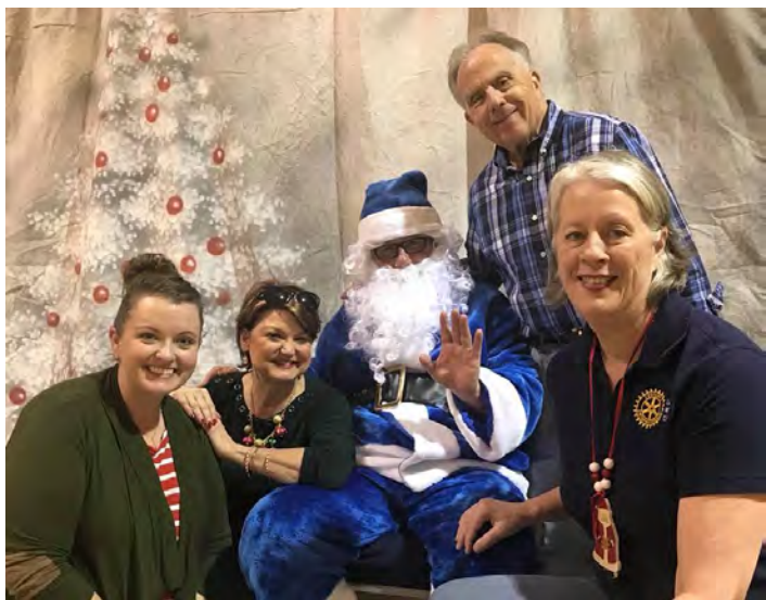
Finally, Lufkin Rotary Club was proud to help the Lufkin Police Department bring Blue Santa to Hope Center! Thanks to Brookshire Brothers and Marco's Pizza for helping as well. It was a great event!