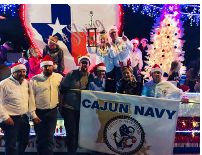
Appreciation plaque given to the Cajun Navy

Winning float by JSC Federal Credit Union